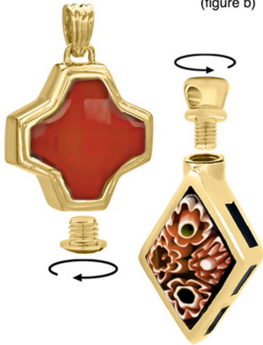
Bail Style Keepsake (figure b)

Step 1 : We offer keepsakes with either a set screw design or a threaded bail design. These instructions are for both styles. Begin by removing the threaded bail or set screw by turning it counterclockwise. (figure b)